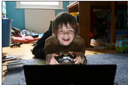
Previous gulfs between generations, such as views on sex and music, have been replaced by the digital divide